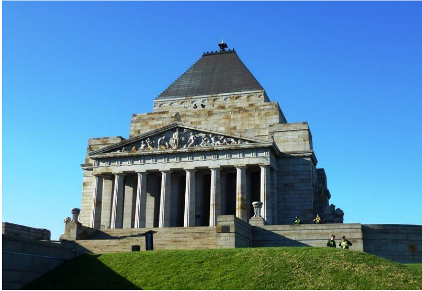
Shrine of Remembrance

The 8th Field Company Engineers are commemorated at the Shrine of Remembrance, St. Kilda Road, Melbourne, Victoria.